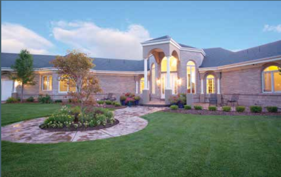
BELL CANYON LOCATION

It is our sincere belief that the healing of self is a journey that is to be given the deepest of reverence and respect... thus it is our honor to assist on this path back to wholeness.