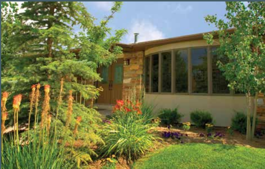
MOUNTAIN VIEW LOCATION