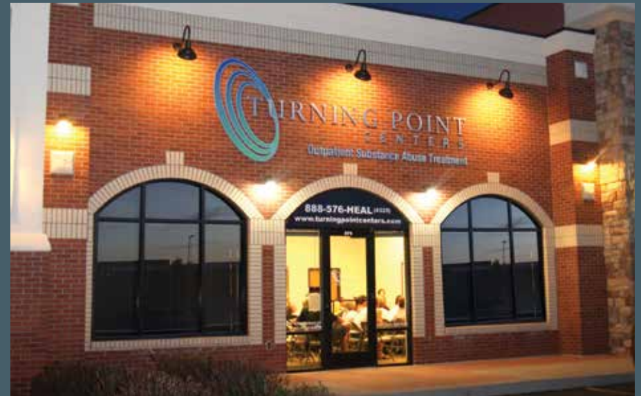
DRAPER INTENSIVE OUTPATIENT LOCATION